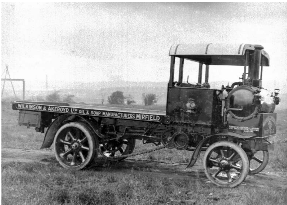
Above - A Yorkshire Wagon from the L&DTEC Collection - Flat wagon for Wilkinson and Akeroyd. Mirfield.

Left - The couple of Yorkshire wagons owned by Stiff's - taken at the maker's premises prior to delivery.